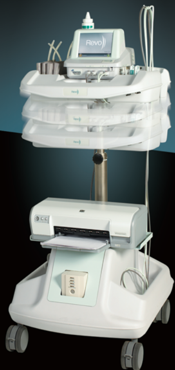
The Revo® on its optional height adjustable pedestal.